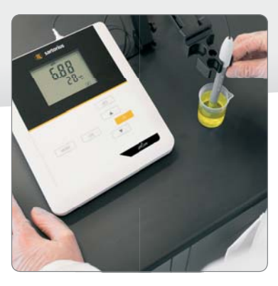
Better results with auto reading stability control indicators