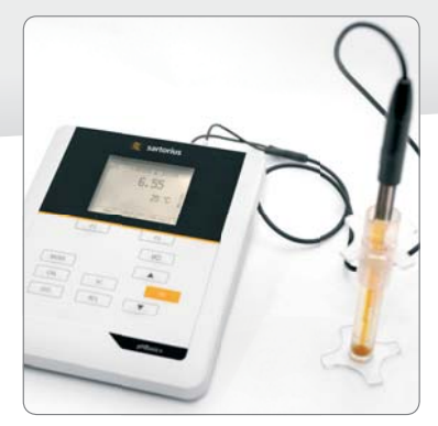
Variety of kits designed with unique electrodes that fit your sample applications needs