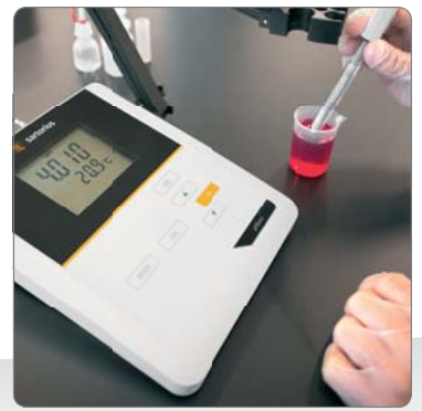
Ensure the basics are covered and that meter, electrode and user are in sync together in one simple system