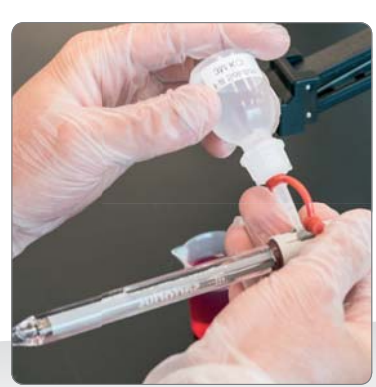
Innovative evaporation gate. Insert, press and refill internal chamber. Gate mitigates constant need to refill electrolyte and protects from secondary contamination.