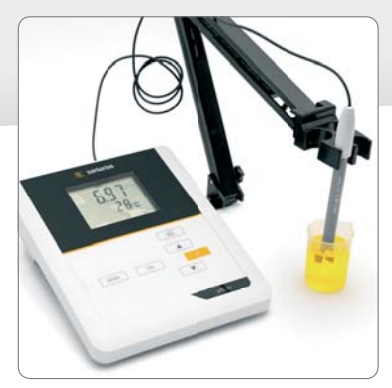
Keep it simple with the core essentials