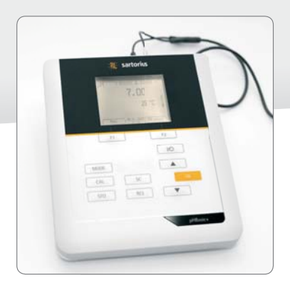
Simple keypad and user friendly navigation screen