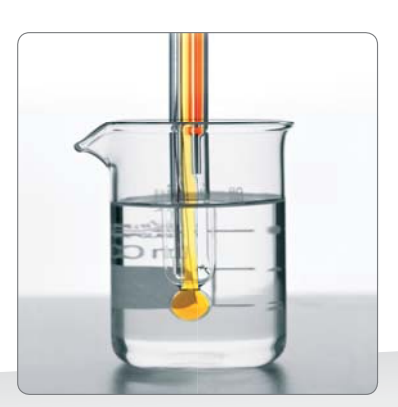
Superior construction, materials and design when it comes to body style, sensor shape and reference systems. Diverse selections to meet your unique sample types.