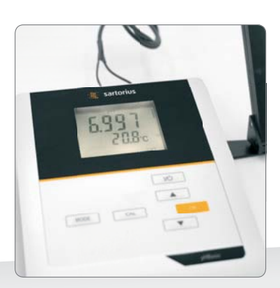
Feel reassured your results are accurate all the time