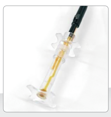
Ready to go storage vessel. Reduces refilling when storing overnight or longer periods. Keeps electrode sensor membrane hydrated at all times.