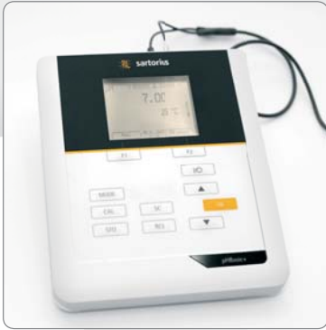
Simple keypad and user friendly navigation screen