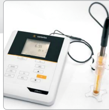
Variety of kits designed with unique electrodes that fit your sample applications needs