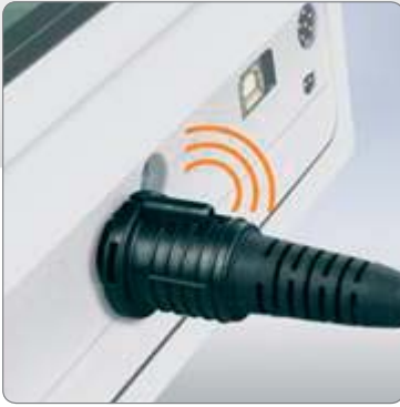
Automatic wireless sensor recognition