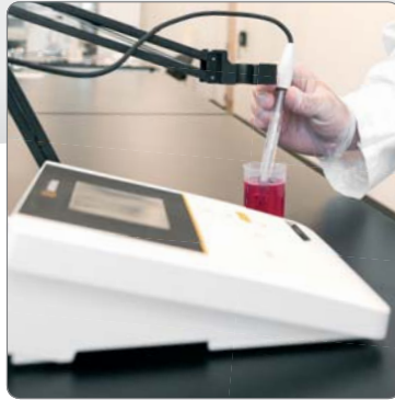
Streamlined profile with data export options