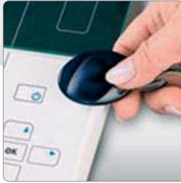
User recognition with electronic ID card