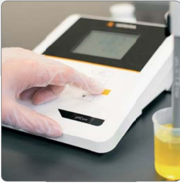
Easy to use interface