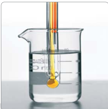
Superior construction, materials and design when it comes to body style, sensor shape and reference systems. Diverse selections to meet your unique sample types.