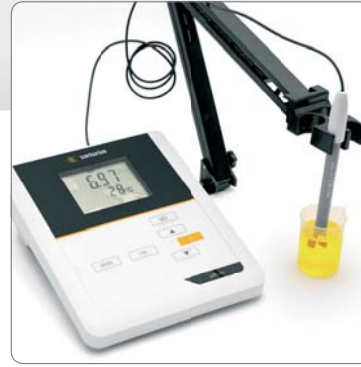
Keep it simple with the core essentials