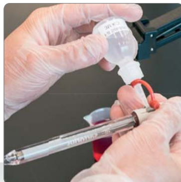
Innovative evaporation gate. Insert, press and refill internal chamber. Gate mitigates constant need to refill electrolyte and protects from secondary contamination.