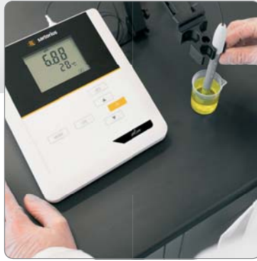
Better results with auto reading stability control indicators