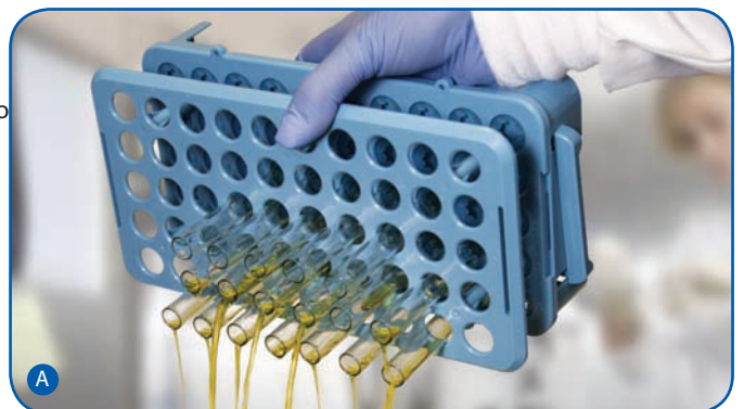
Both racks feature rubber grips that hold tubes securely in place when decanting liquids